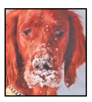
Check me out on www.youtube.com irish setter